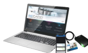
SECard SECard configuration kit and SSCP® v1 & v2 and OSDPT™ v1 & v2 protocols