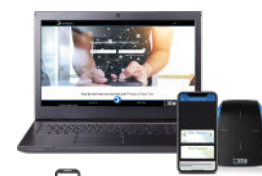
STid Mobile ID Online Portal Web platform for remote management of your virtual cards

* Our readers only read the / UID PICO1444-3B serial number of the iCLASS™ chip. They do not read the cryptographic protections iCLASS™ nor the / UID PICO 15693 serial number of HID Global.